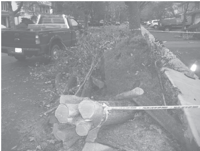
Downed Trees Following Sandy