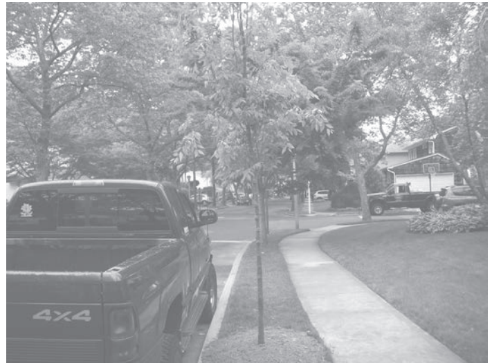
Photo of tree plantings this fall

A year later, we have made substantial progress in making repairs and replanting all felled trees throughout the Village. All Village property, sidewalks and streets damaged during the storms have been repaired. If there are any trees or sidewalks that appear to have not been fixed, please notify the Village.