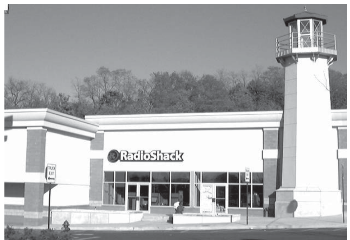
The town's first national retail chain store just opened in Port North in Stop & Shop Plaza. Radio Shack will now serve your computer and electronic needs much closer to home.